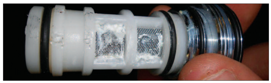
A TMV strainer with pipe joining compound, Boss White, accumulated on strainer mesh. Pseudomonas aeruginosa was recovered from this TMV strainer and many others within this particular system.

During sample collection, medical equipment and/or personal items were found in 4.1% of handwash basins. When sampled, these handwash basins were associated with a 14.3% increase in outlet positivity. Items found included toothbrushes, children's toys, used bedpans, saline drip bags, catheters,