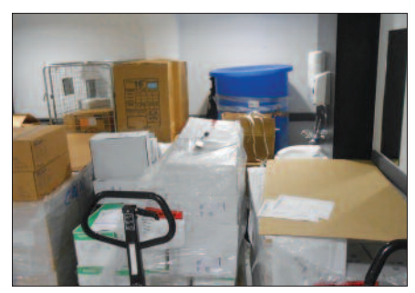
One of the many outlets recorded as 'little used'. P aeruginosa was infrequently detected at outlets with little human interaction.

From the 1,238 outlets that had been tested for both P. aeruginosa and Legionella , there was no obvious correlation between the presence or absence of either organism. This supports