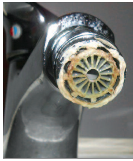
A heavily scaled plastic tap insert in an augmented care ward, which is also showing some evidence of biofilm.

In terms of the analysis of all samples, the mean positivity per ward for P. aeruginosa