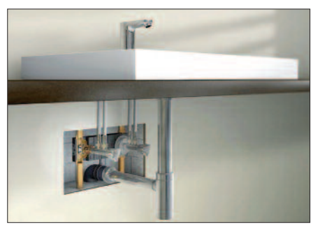
The Kemper HyTwin system allows water to recirculate up to and through the tap outlet, with the aim of further reducing environments for biofilm to develop.

Some POU filters were poorly fitted, resulting in water leaking from the tap onto the top of the POU filter housing.