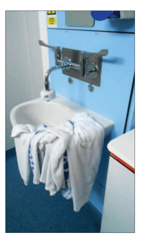
A handwash basin used inappropriately for storage of used towels. Note the point-of-use filter fitted to prevent the release of Pseudomonas aeruginosa due to repeated colonisation of the outlet.

With data from over 6,000 P. aeruginosa samples that I have collected from 14 hospital Trusts across the UK, trial data of new Pseudomonas detection and control technologies, and my involvement with various Trusts as an Authorising Engineer (Water) and independent consultant, it is